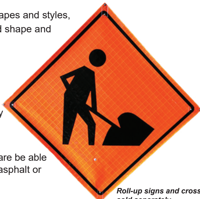
Roll-up signs and cross-ribs sold separately

Two coil springs mounted vertically prevent twisting and ensure stability with 120,000-PSI tensile self-locking bolts.