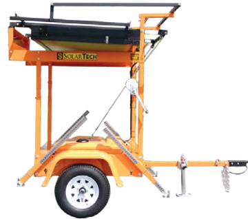
MB-III lowered and folded compactly for transport.