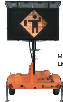
MB-III Lift & Rotate